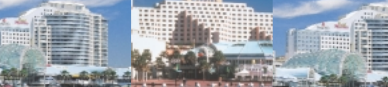
From left to right: Mercure Grand Apartments Darling Harbour Novotel Sydney on Darling Harbour Hotel Ibis Darling Harbour